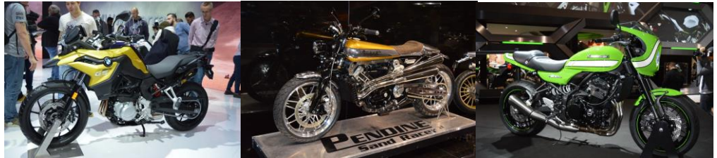
BMW F-GS 850

In far away places, motorcycle activities are still going on. In Milan Italy, they had the EICMA, one of two large motorcycle shows over there, where manufacturers show their new models and concepts to gauge customer interest. Here are a few examples of what is new for 2018: