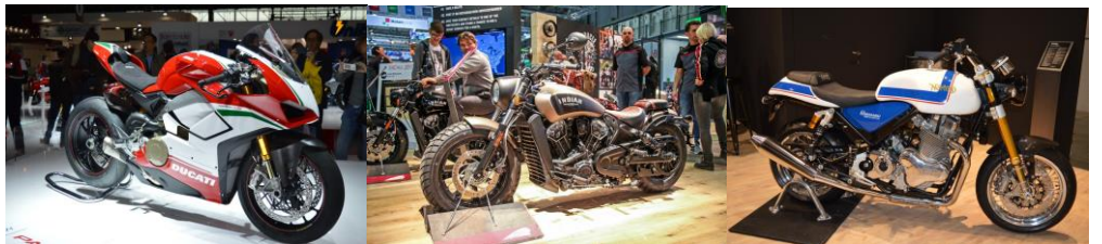
Ducati Panigale V-4